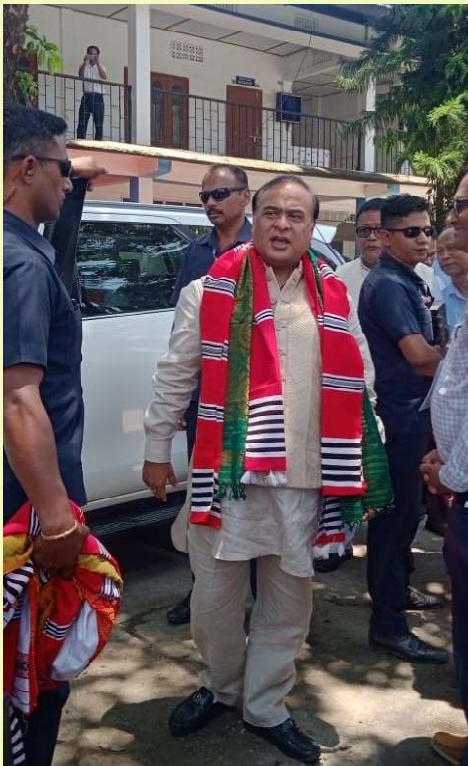
Dr. Himanta Biswa Sharma Hon'ble Chief Minister of Assam visited the College.