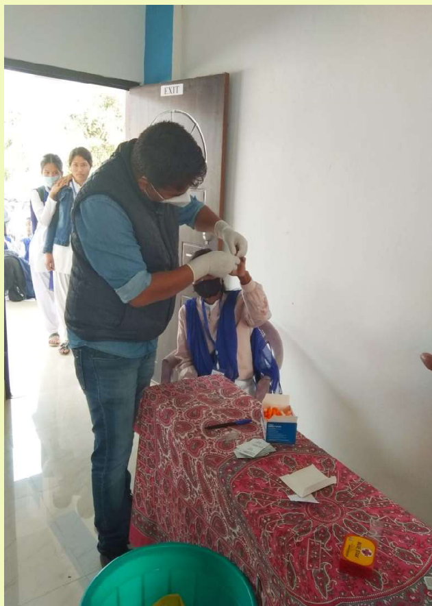
Blood Grouping Test Camp