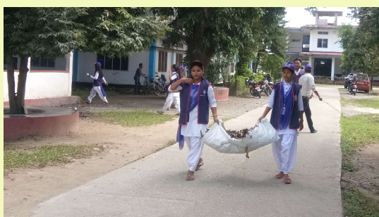
Clean Drive Programme at College Campus by NSS Volunteers