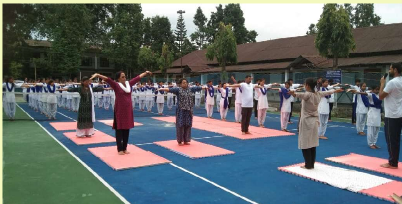
Gogamukh College Yoga Students exercise Yoga in association with Rudraksh Yoga V i g y a n Mahavidyalaya at College Campus.