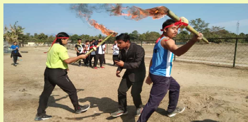
Olympic Flame carry over to open the Sports Week