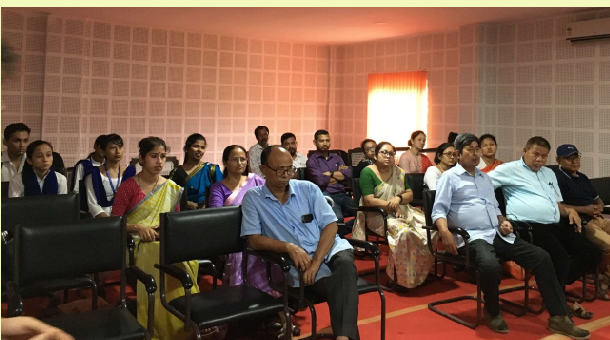
DIGITAL CONFERENCE ROOM