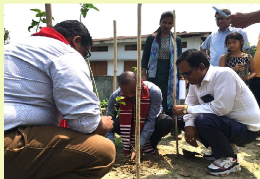
Plantation at Environment Day