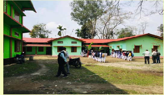
GIRLS' HOSTE CAMPUS