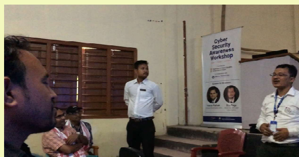
Awareness Programme on Cyber Crime in collaboration with Gratia Technology Pvt. Ltd, Guwahati.