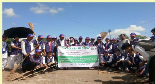
'Swaccha Ki Sewa' Aviyan