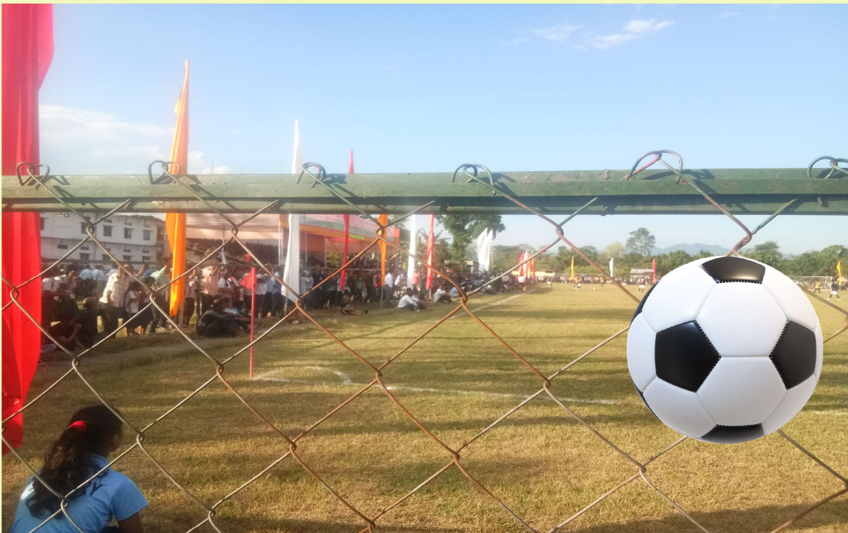
FOOT BALL PLAYGROUND