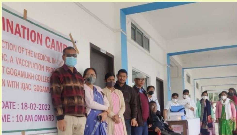
Covid-19 Vaccination Camp