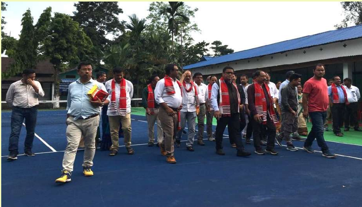
Dr. Ranoj Pegu, Hon'ble Education Minister of Assam after opening the Gogamukh College Tennis Court (Hard).