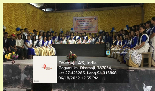
A Farewell Session